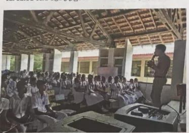
සිසුන් දැනුවත් කිරීම

හිරීම, මත්දවස නිවාරණ වැවසරාහන, හා පෘණු ලුම්කයන්ව NVQ සහතික වර්තමෙම විවස්තවන පදහා ගෙනීම වර්තමේ වැවස්තවන පදහා ගෙනීම පිරිමිණ මදිය පිරි සිදු විත. එමෙනීම මෙහිදී විශා ලේවලීමේ වෙමවනයක දේශ පේඩරීම් නිර්වාස්තය සිරීමේ රනේරුව විචේච් ප්රජාතය කිරීමේ රනේරුව විචේච් ජලේ ගෙන මෙත් කිරීමේ විමේඛතා. වේවාසික විභාගත් කාර්යාගුය ශ්රීම මේම විදිලාම පවත්වන ශූ ද වැවසර කේම විදිලාම පවත්වන ඉද වැවසර නත් 500 දෙනකුගේ සහභාගිත්වය