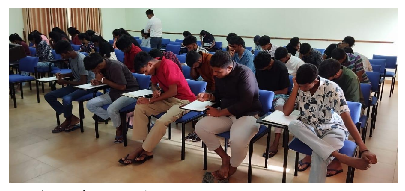
Pre and Post test for program evaluation