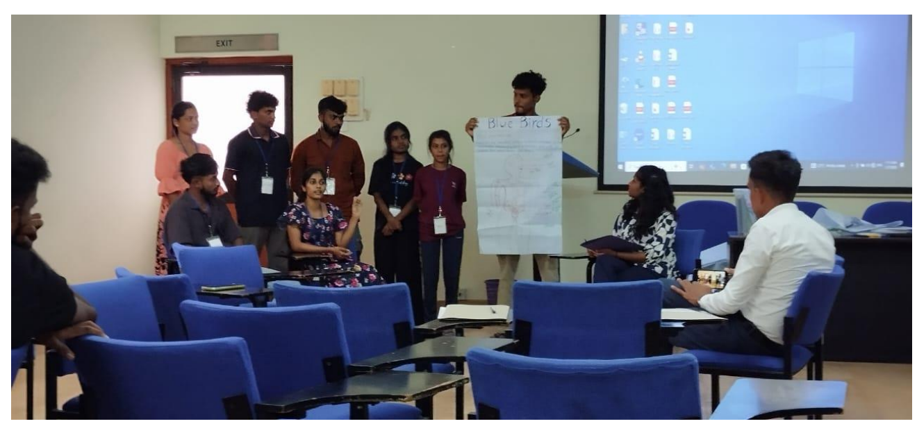
Role-plays and Presentations

- Preventive Education and Training Division of National Dangerous Drugs Control Board.